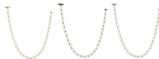
Hand Rubbed Antique Brass

Includes 28.7 watt, 1582 total delivered lumens, 90 CRI 2700K or 3000K LED modules. Remote dimmable with most LED compatible ELV and TRIAC dimmers. 277V dimmable with 0-10V dimmers. Surface dimmable with ELV and TRIAC dimmers. Remote 120V or 277V. Surface 120V-277V. Can be installed on a sloped ceiling up to 45°.