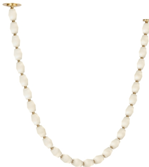
Hand Rubbed Antique Brass