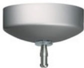
MonoRail Surface Transformer-75W Mag