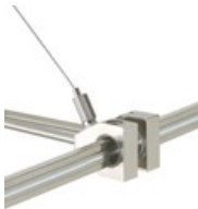
MonoRail Support Outside Rigger