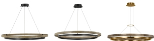
Matte Black/Weathered Oak Wood