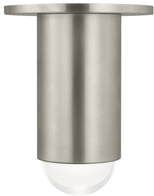
Antique Nickel (Lit)

Includes 120V-277V 10.6 watts, 661 delivered lumens, 90 CRI 2700K LED module. Dimmable with most LED compatible ELV, TRIAC and 0-10V dimmers. Ceiling mount only.