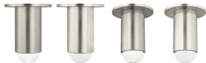
Antique Nickel (Lit) Antique Nickel (Unlit) Antique Nickel (Alt Lit) Antique Nickel (Alt Unlit)

To view all available finish options, please visit techlighting.com