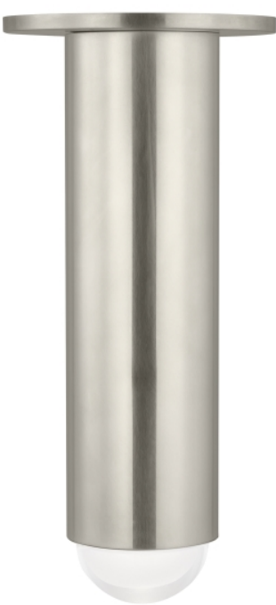
Antique Nickel (Lit)

Includes 120V-277V 10.6 watts, 751 delivered lumens, 90 CRI 2700K LED module. Dimmable with most LED compatible ELV, TRIAC and 0-10V dimmers. Ceiling mount only.