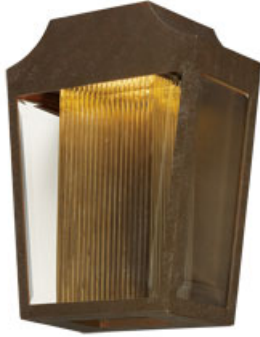
85632CLTRAE Villa LED Outdoor Wall Lantern