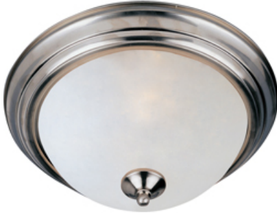
5840FTSN Essentials 1-Light Flush Mount