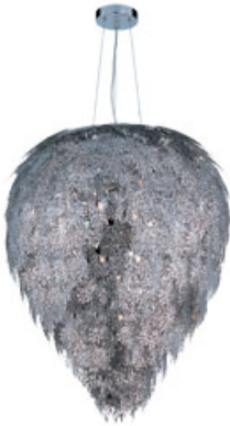
39769PC Vineyard 9-Light Pendant