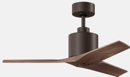
MW-TB-WA-42 Textured Bronze Finish, with 42" Walnut Tone Blades