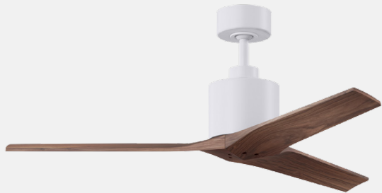
MW-MWH-WA-52 Matte White Finish, with 52" Walnut Tone Blades