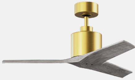
MW-BRBR-BW-42 Brushed Brass Finish, with 42" Barn Wood Tone Blades