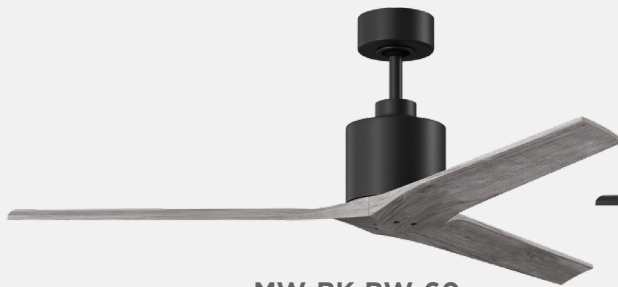
MW-BK-BW-60 Matte Black Finish, with 60" Barn Wood Tone Blades