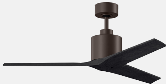
MW-TB-BK-52 Textured Bronze Finish, with 52" Matte Black Blades