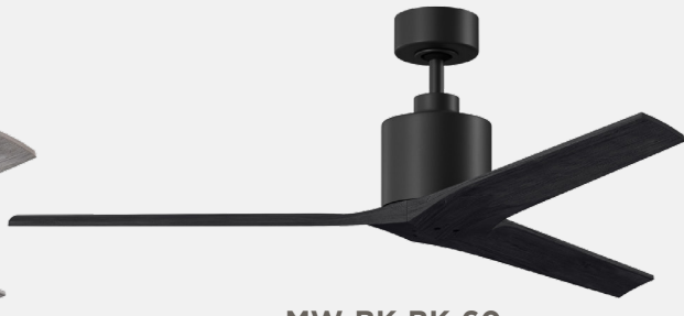
MW-BK-BK-60 Matte Black Finish, with 60" Matte Black Blades