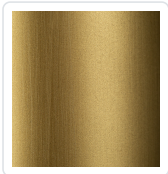
Brushed Gold (BG)