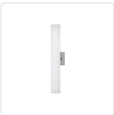
WS8424-BN Brushed Nickel