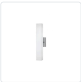
WS8418-BN Brushed Nickel