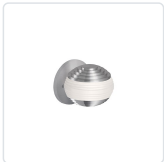
WS10502-BN Brushed Nickel