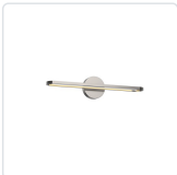
VL63724-BN-UNV Brushed Nickel