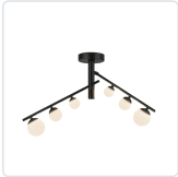
SF55525-BK/OP-UNV Black/Opal Matte Glass