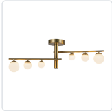
SF55525-BG/OP-UNV Brushed Gold/Opal Matte Glass

Juniper’s shape expands and contracts to suit your space’s needs. Each branch of the Juniper collection adjusts to lengthen or collapse, creating a customized look. Atop each arm sits three growing Matte Opal glass globes stretching outwards to create depth and emphasis.