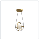
PD76708-BG-UNV Brushed Gold