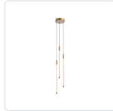
MP75221-BG Brushed Gold