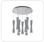
MP42502BN-09 Brushed Nickel

Formed aluminum hour-glass shade. Dual translucent acrylic diffusers. Matte powder-coated or plated finish. Up and down light.