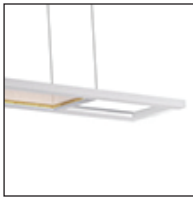
BN - Brushed Nickel