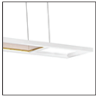
WH - White