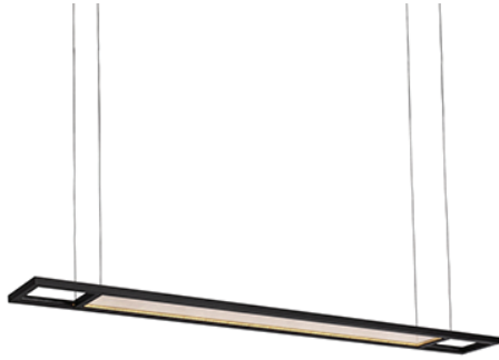
BK - Black