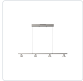
LP19937-BN Brushed Nickel