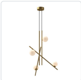
CH89832-BG/GO Brushed Gold/Glossy Opal Glass