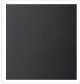
Matte Black (MB)