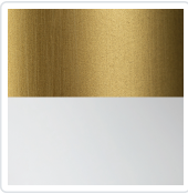
Brushed Gold/Matte White (BG/WH)