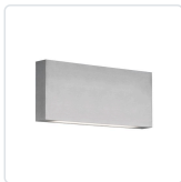
AT6610-BN Brushed Nickel