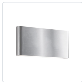
AT6510-BN-UNV Brushed Nickel