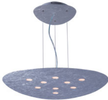
E20785-SF Palette LED Pendant