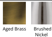
Aged Brass Brushed Nickel