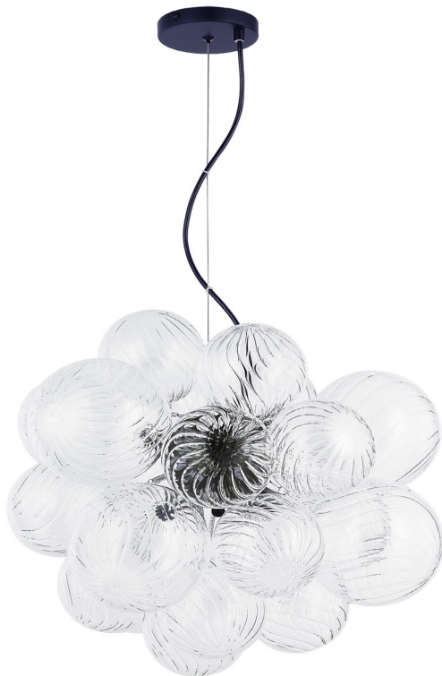
6 Light Halogen Pendant Matte Black with Clear Spiral Glass

Height 20 Width/Length 20 Depth 20 Weight 6.5