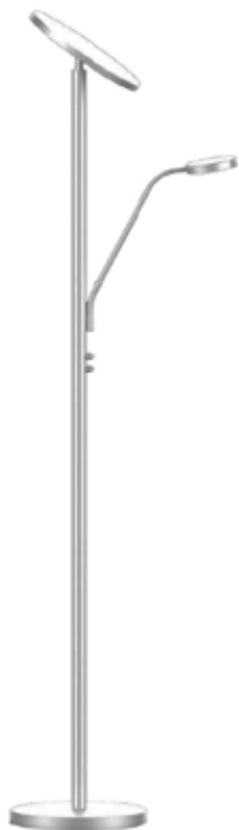
Mother and Son LED Floor Lamp, Satin Nickel Finish