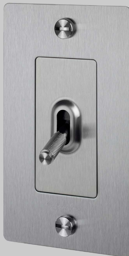
[ finish. STEEL. ]