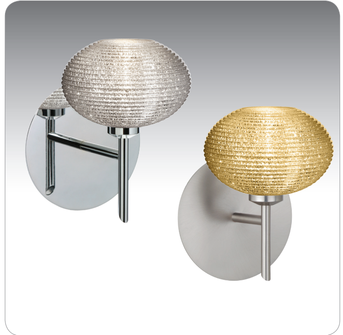
LASSO SHOWN IN GLITTER (5612GL) IN CHROME FINISH & GOLD GLITTER (5612GD)

UL or ETL Listed. Suitable for Damp Locations (interior use only).