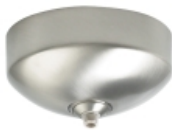
FreeJack Surface Canopy LED