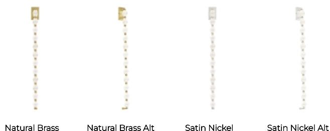
Natural Brass Alt

To view all available finish options, please visit techlighting.com