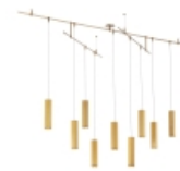
Blok Small Chandelier