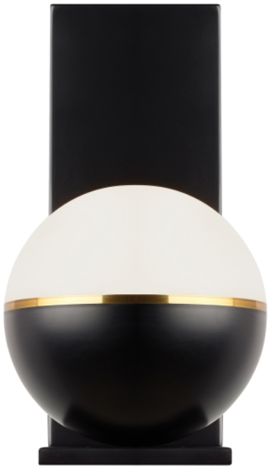
Matte Black / Aged Brass

Includes 14 watt, 556 delivered lumen, 2700K or 3000K LED module. Dimmable with low-voltage electronic or triac dimmer.