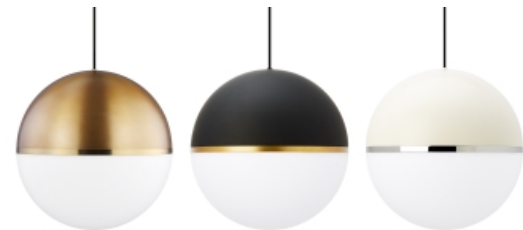
Aged Brass/Bright Brass