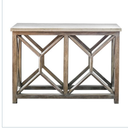
CATALI CONSOLE TABLE