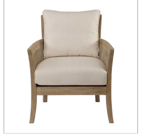
ENCORE ARMCHAIR, NATURAL