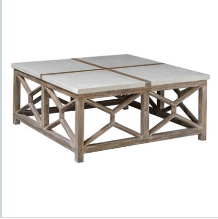
CATALI COFFEE TABLE