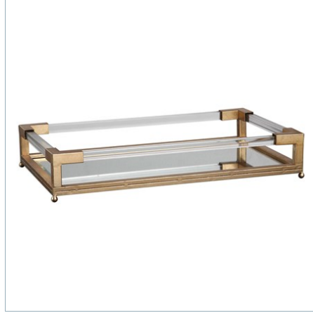
BALKAN TRAY 18706 | 24 W X 5 H X 15 D (IN)