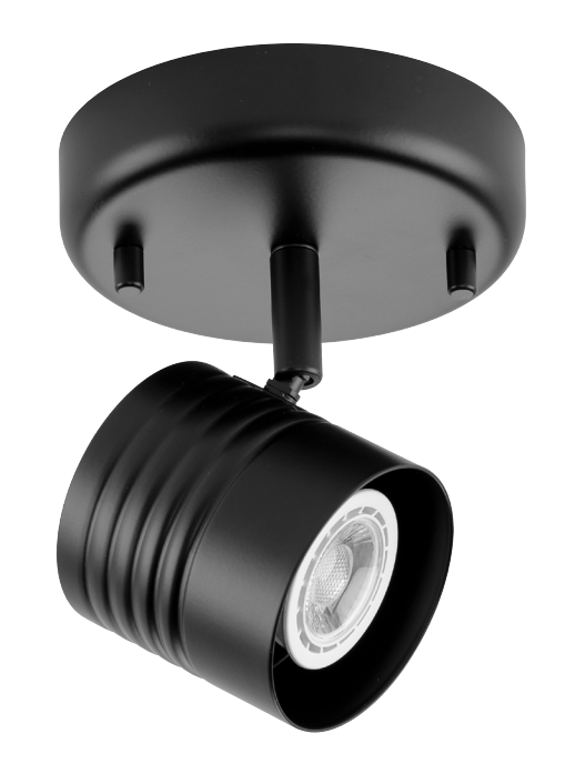
Width: 5 in Height: 5-15/16 in Depth: 5 in