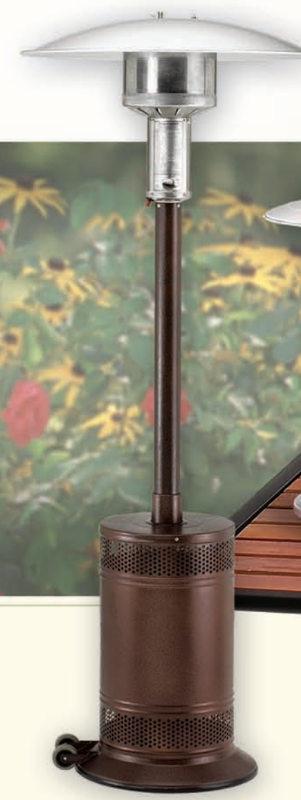
Model PC-02-AB (Antique Bronze)