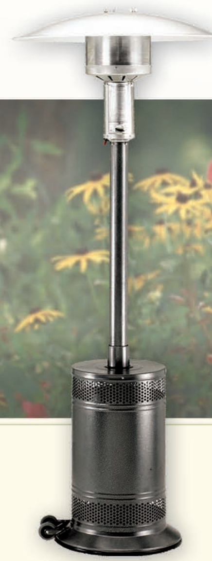
Model PC-02-JSV (Jet Silver Vein)