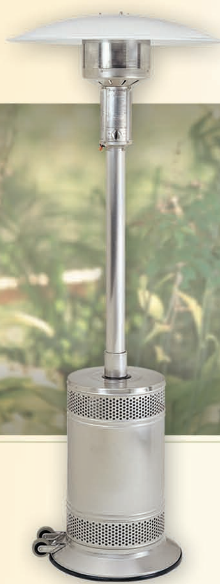
Model PC-02-S (Stainless Steel)