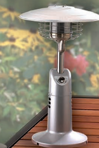
Model PC-TT (Stainless Steel)