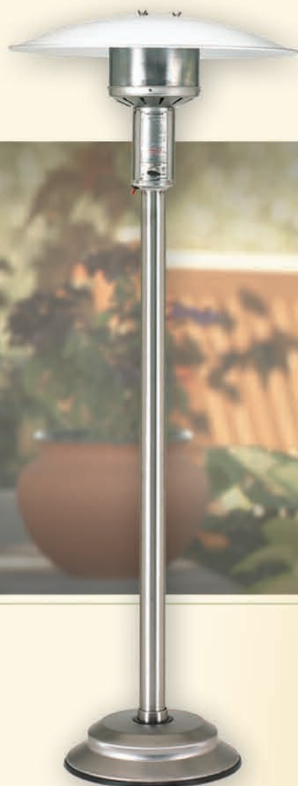
Model NPC-05 (Stainless Steel) Also Available in Antique Bronze

When a full size “lifestyle” heater isn’t required, take a close look at our Patio Comfort Table Top Heater. This “Mini” outdoor table top provides a 360 degree circle of radiant heat that will heat a six to seven foot circle in minimal wind conditions. Our PC TT is perfect for smaller outdoor dining areas, or for any of your outdoor activities. The PC TT is designed for outdoor use only with a standard 16 oz. throw away cylinder (not inc.) For your safety all Model PC TT’s include a tip over sensor and “ODS” (Oxygen Depletion Sensor) to immediately turn off the unit if it should fall over or senses too little available oxygen.