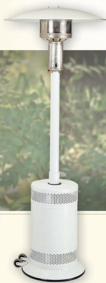
Model PC-02-W (White)