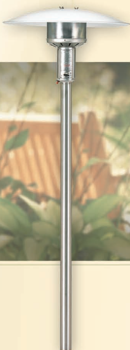
Model NPC-05 SSP In Ground (Stainless Steel)