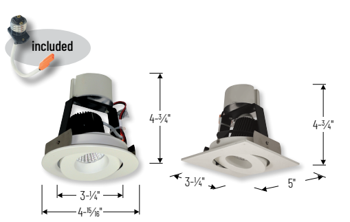
Square Cone Regress 40° Adj.(varies by housing) BB, BW, BZ, HW, MPW, NN, WW