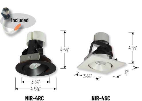
Round Cone Regress 40° Adj.(varies by housing) BB, BW, BZ, HW, MPW, NN, WW