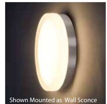
Shown Mounted as Wall Sconce

For 277V special order, add an "F" before the finish: FM-4109F-BN