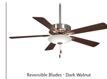
Reversible Blades - Dark Walnut