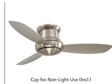
Cap for Non-Light Use (Incl.)