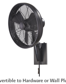
Convertible to Hardware or Wall Plug