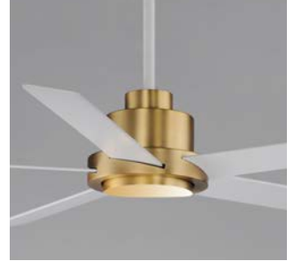
Light Kit Cover Plate Included

FCT8881WT (Included) AC Wall Control, Light Dimming and Fan Control