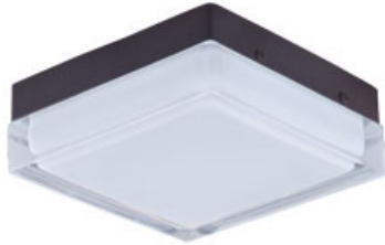
87644CLWTBZ Illuminaire LED Flush Mount