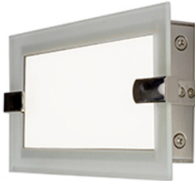
87622CLFTSN Trim LED 12" Vanity