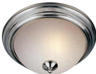
5840ICSN Essentials 1-Light Flush Mount