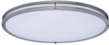
55548WTSN Linear LED Flush Mount